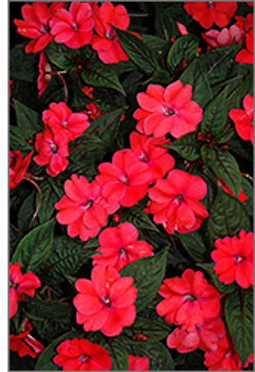
SunPatiens Compact Deep Rose New Guinea Impatiens flowers

This plant will require occasional maintenance and upkeep, and should not require much pruning, except when necessary, such as to remove dieback. It is a good choice for attracting bees and butterflies to your yard. It has no significant negative characteristics.