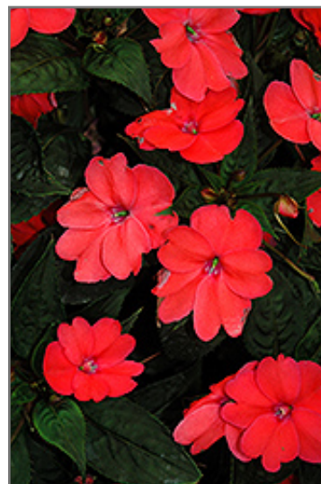
SunPatiens Compact Coral New Guinea Impatiens flowers

SunPatiens Compact Coral New Guinea Impatiens is recommended for the following landscape applications;