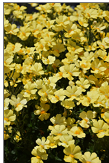
Sunsatia Lemon Nemesia flowers