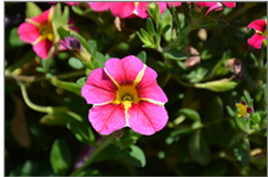
Superbells Cherry Star Calibrachoa flowers

Superbells Cherry Star Calibrachoa is a dense herbaceous annual with a trailing habit of growth, eventually spilling over the edges of hanging baskets and containers. Its medium texture blends into the garden, but can always be balanced by a couple of finer or coarser plants for an effective composition.