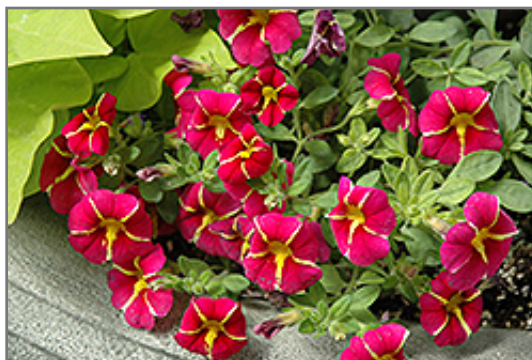
Superbells Cherry Star Calibrachoa flowers