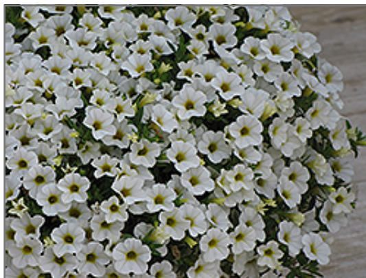
Cabaret White Calibrachoa flowers