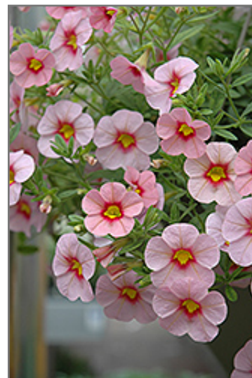
Aloha Tiki Soft Pink Calibrachoa flowers