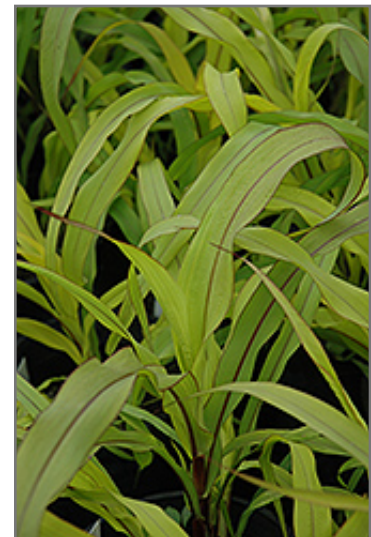
Jester Millet foliage