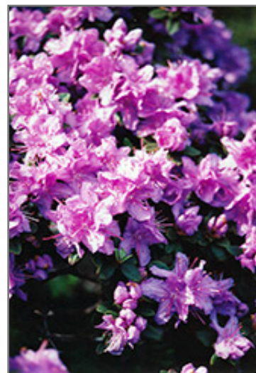
Ramapo Rhododendron flowers