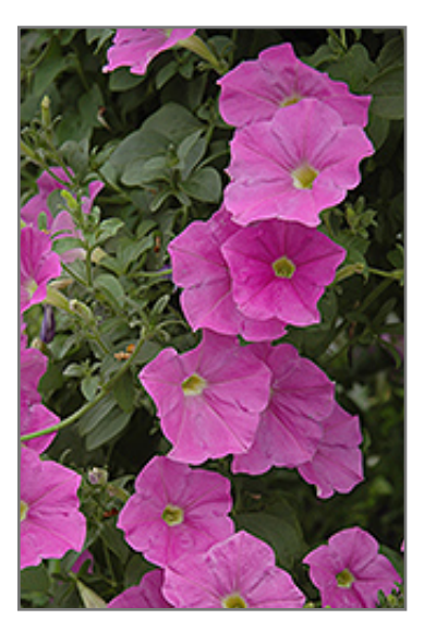
Supertunia Lavender Skies Petunia flowers