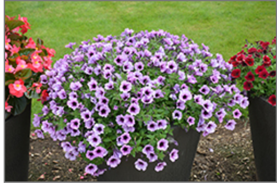
Supertunia Bordeaux Petunia in bloom

Supertunia Bordeaux Petunia will grow to be about 10 inches tall at maturity, with a spread of 24 inches. When grown in masses or used as a bedding plant, individual plants should be spaced approximately 20 inches apart. Its foliage tends to remain low and dense right to the ground. This fast-growing annual will normally live for one full growing season, needing replacement the following year.