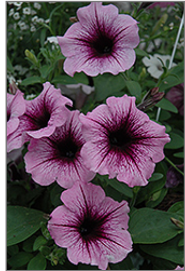
Supertunia Bordeaux Petunia flowers

Supertunia Bordeaux Petunia is recommended for the following landscape applications;