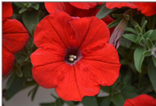
Sweetunia Hot Rod Red Petunia flowers