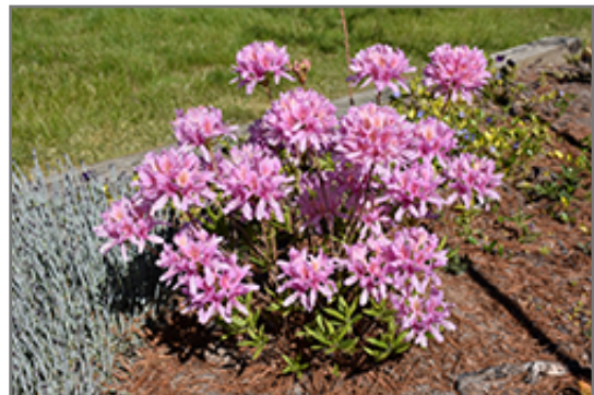
Orchid Lights Azalea in bloom