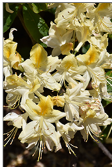
Northern Hi-Lights Azalea flowers