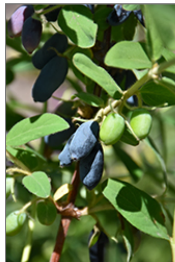
Cinderella Honeyberry fruit

This is a dense multi-stemmed deciduous shrub with a more or less rounded form. Its average texture blends into the landscape, but can be balanced by one or two finer or coarser trees or shrubs for an effective composition. This plant will require occasional maintenance and upkeep, and is best pruned in late winter once the threat of extreme cold has passed. It is a good choice for attracting butterflies to your yard. It has no significant negative characteristics.