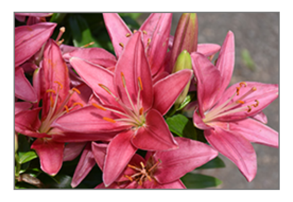
Lily Looks Tiny Pearl Lily flowers

This variety is a compact lily that bears well formed, upward facing, bright pink blooms; perfect for containers or massing along borders