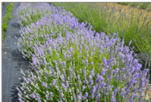
Blue Cushion Lavender in bloom