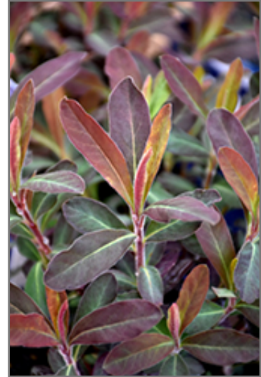
Purple Wood Spurge foliage

* This is a 'special order' plant - contact store for details