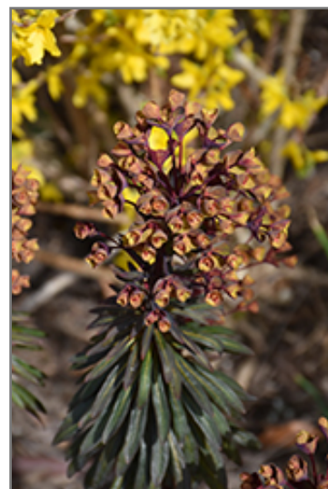
Purple Wood Spurge flower buds