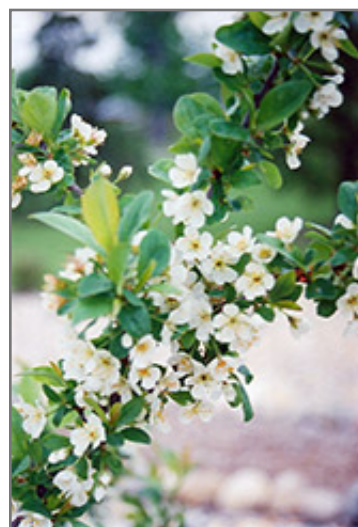
Opata Cherry-Plum flowers