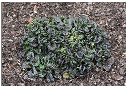
Mini Crisp Red Bugleweed