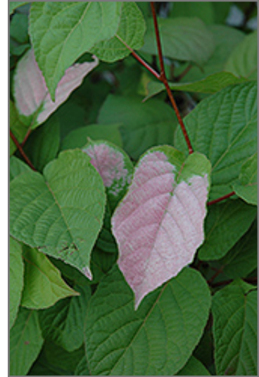
September Sun Kiwi foliage

September Sun Kiwi is recommended for the following landscape applications;