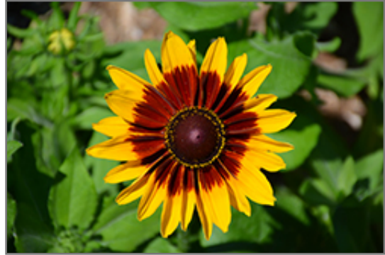
Denver Daisy Coneflower flowers

Denver Daisy Coneflower is an herbaceous perennial with an upright spreading habit of growth. Its medium texture blends into the garden, but can always be balanced by a couple of finer or coarser plants for an effective composition.