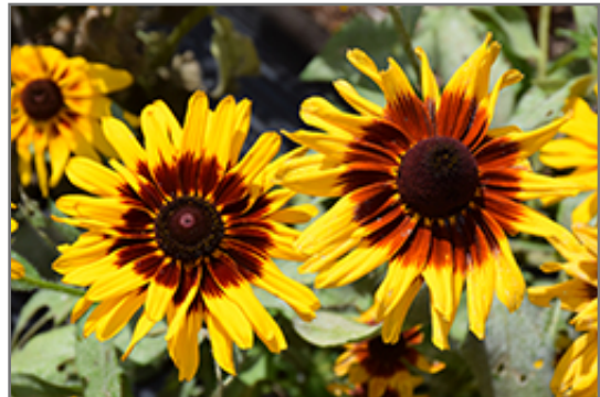
Denver Daisy Coneflower flowers