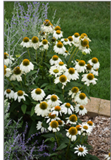
PowWow White Coneflower in bloom