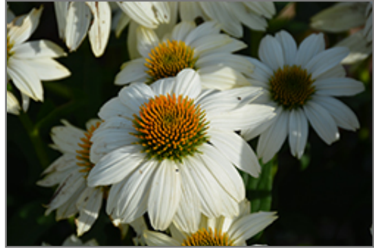
PowWow White Coneflower flowers

This is a relatively low maintenance plant, and is best cleaned up in early spring before it resumes active growth for the season. It is a good choice for attracting birds and butterflies to your yard, but is not particularly attractive to deer who tend to leave it alone in favor of tastier treats. It has no significant negative characteristics.