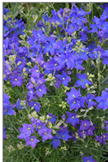
Diamonds Blue Delphinium flowers