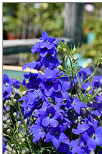
Diamonds Blue Delphinium flowers