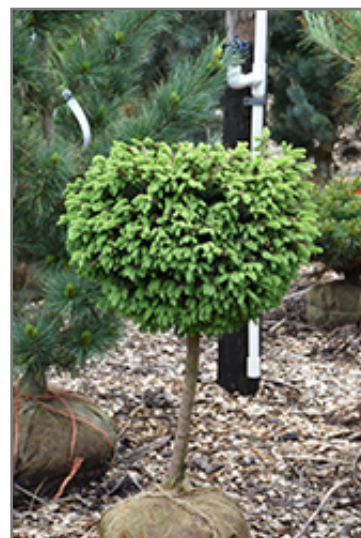
Little Gem Spruce (tree form)