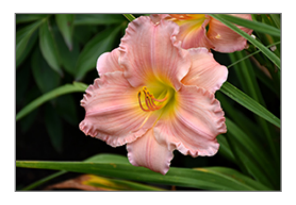
Jolyene Nichole Daylily flowers