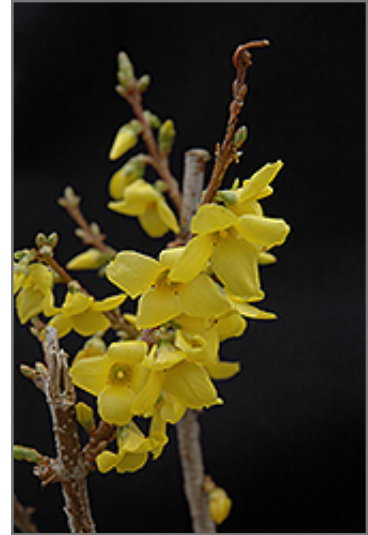
Show Off Forsythia flowers

Show Off Forsythia makes a fine choice for the outdoor landscape, but it is also well-suited for use in outdoor pots and containers. With its upright habit of growth, it is best suited for use as a 'thriller' in the 'spiller-thriller-filler' container combination; plant it near the center of the pot, surrounded by smaller plants and those that spill over the edges. It is even sizeable enough that it can be grown alone in a suitable container. Note that when grown in a container, it may not perform exactly as indicated on the tag - this is to be expected. Also note that when growing plants in outdoor containers and baskets, they may require more frequent waterings than they would in the yard or garden. Be aware that in our climate, most plants cannot be expected to survive the winter if left in containers outdoors, and this plant is no exception. Contact our experts for more information on how to protect it over the winter months.