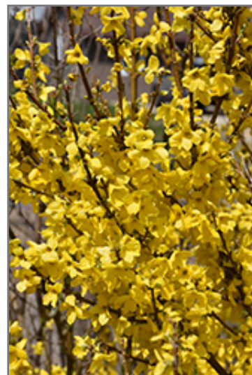
Show Off Forsythia flowers

Show Off Forsythia is recommended for the following landscape applications;