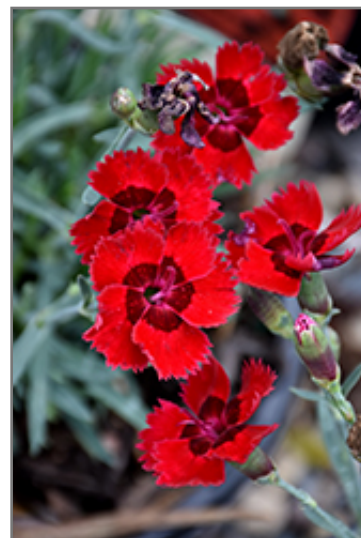
Fire Star Pinks flowers

Fire Star Pinks is recommended for the following landscape applications;