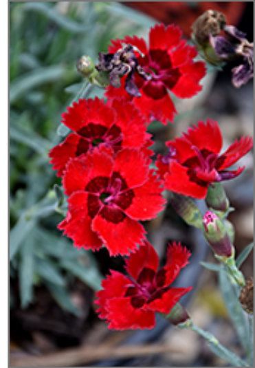
Fire Star Pinks flowers

Fire Star Pinks is recommended for the following landscape applications;