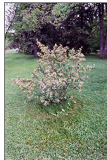
Black Chokeberry in bloom