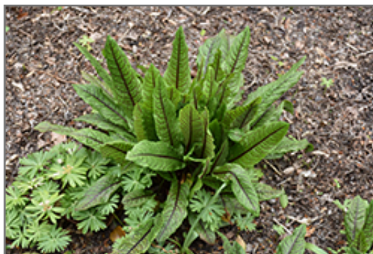
Ornamental Sorrel

Ornamental Sorrel is recommended for the following landscape applications;